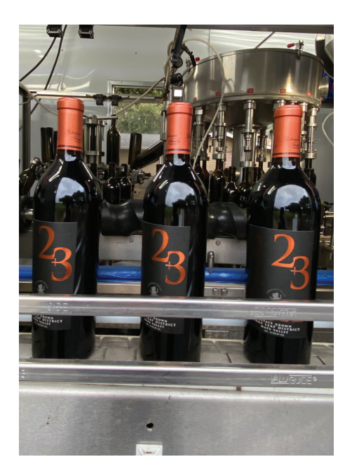
Another 2019 wine now in bottle.