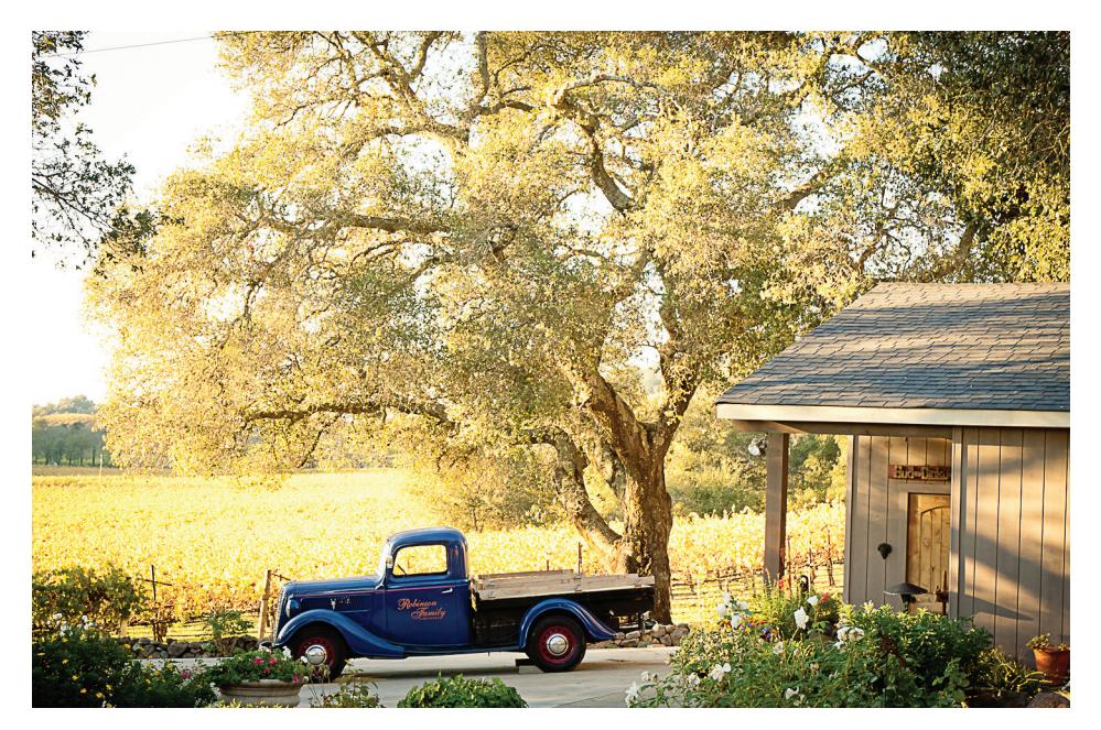
With the 2021 wines now in barrel, we composted the grape stems, seeds and skins back into the vineyard to add nutrients back to the soil for next year. And now, we are enjoying the quiet that comes after the rush of crush.