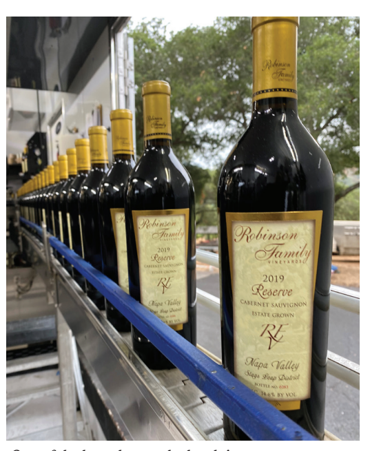
Out of the barrel, into the bottle!